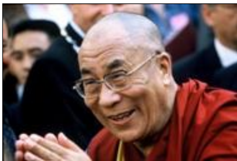
His Holiness the Dalai Lama, Tenzin Gyatso, Nobel Peace Prize Winner