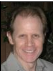
Dr Dan Siegel

Dr. Siegel is currently the executive director of the Mindsight Institute. He is on the clinical faculty at UCLA, where he serves as the Co-director of the Mindful Awareness Research Center and co-investigator at the Center for Culture, Brain, and Development.